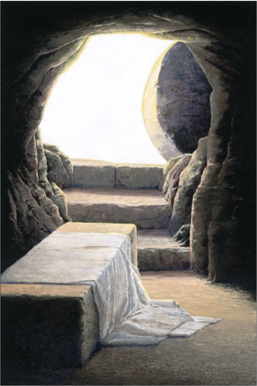
April 24, 2011 7 AM Sunrise Worship